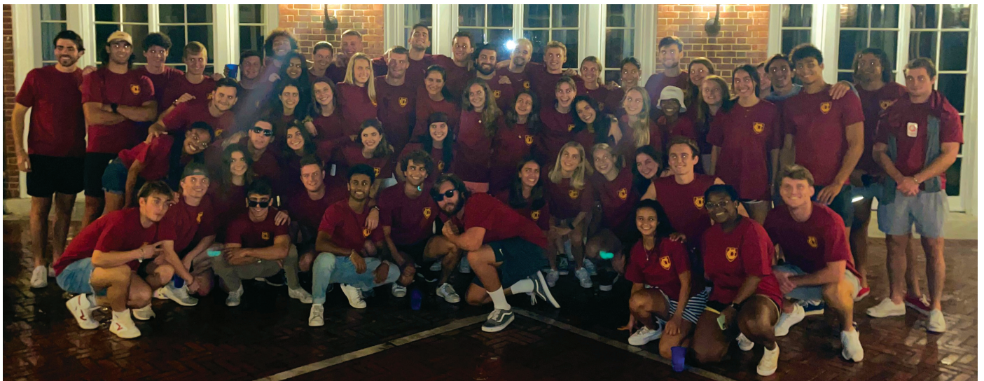
Camp Cottage, 9/23/21

It seems like little has changed on the surface, although everyone is uniquely grateful to be back and eager to make the most of their remaining time here. COVID-19 might have tried its hardest to keep us apart, but it's near impossible to beat the magical atmosphere within Cottage, and never has its motto rang truer: "Where there are friends there are riches." ■