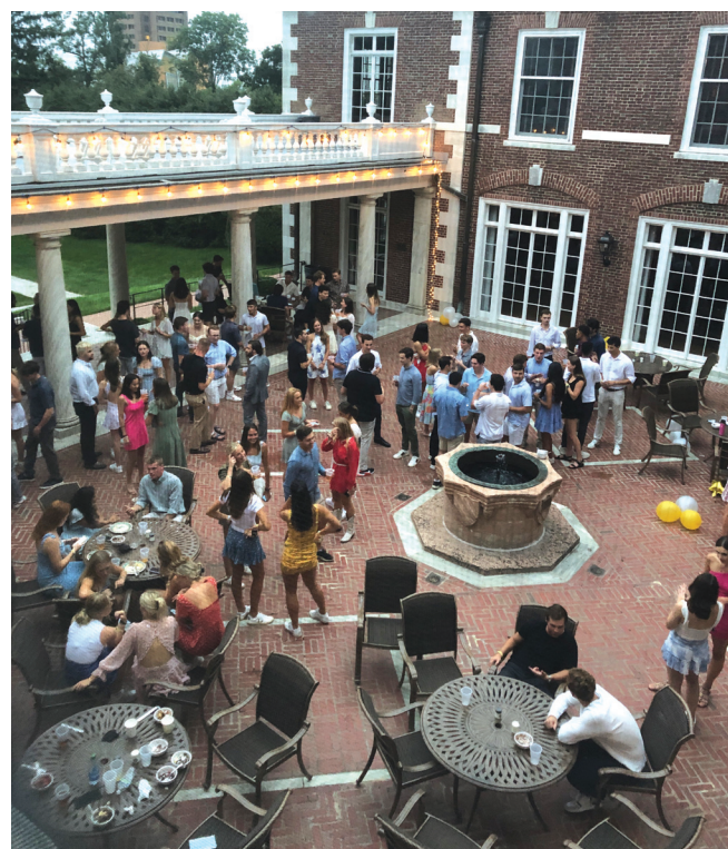
UCC Opening Night Dinner, 9/30/21