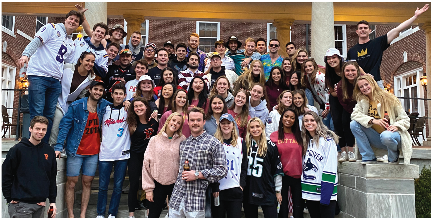
Class of '20 before the shutdown